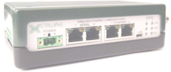
Dimensions (L x W x H): 6.625 " x 3.45 " x 1.835 " / 16.83 cm x 8.76 cm x 4.66 cm Weight 1.54 lbs / 700 grams