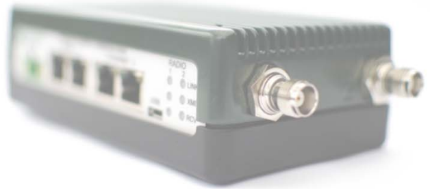
Dimensions (L x W x H): 6.625 " x 3.45 " x 1.835 " / 16.83 cm x 8.76 cm x 4.66 cm Weight 1.61 lbs / 730 grams