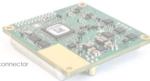
Dimensions (L x W x H) 2.0 " x 2.0 " x 0.37 " / 5.1 cm x 5.1 cm x 0.94 cm Weight 0.06 lbs / 30 grams